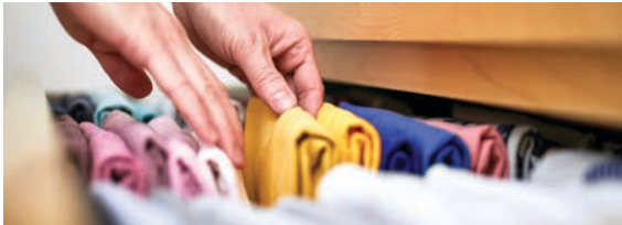
Wash & Fold Laundry